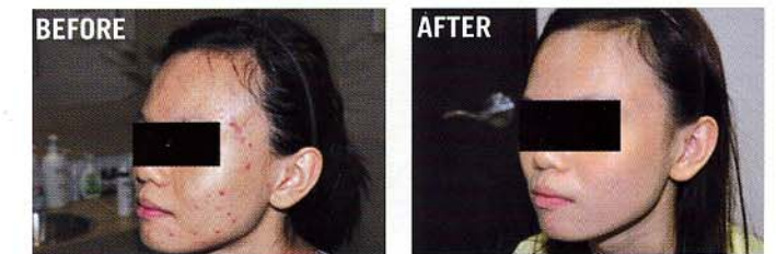
IPL and microdermabrasion are effective to treat acne.

Wen & Weng Medical Group is one of the largest aesthetic medical groups in Singapore with five clinics island wide. Our mission is to provide safe, effective, and affordable aesthetic treatments to our clients in Singapore and the region. Visit www.wen-weng.com.sg for more information.