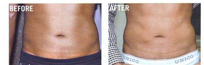
SmartLipo helps to remove resistant fat.